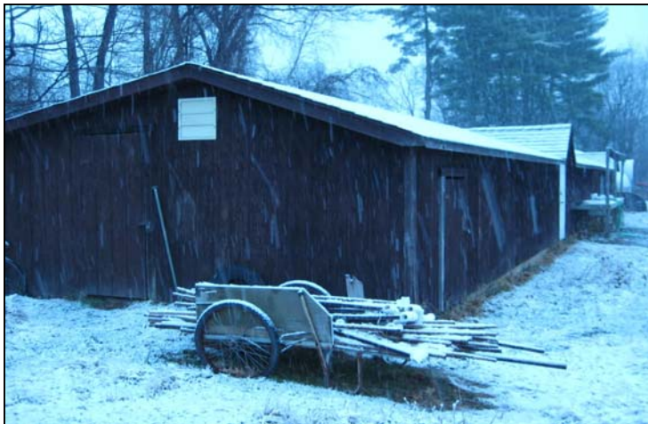
The front third of the coop's roof is new and leak-free, with the back portion is slated for upgrading in 2010.

From time to time we try to take a few moments from our core activities such as growing vegetables and educating youth to take care of site improvements, and if you look closely, maybe you'll even notice what they are (but don't look too closely or you'll see all the other things we ought to do...).