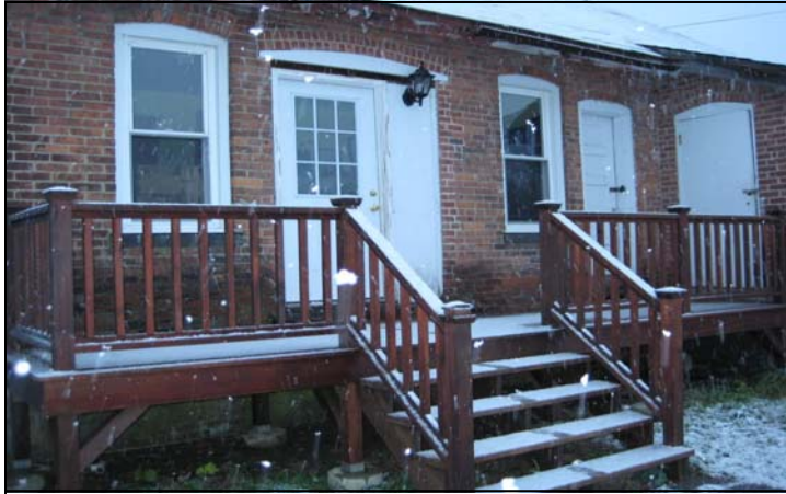
The porch is ready for the winter precipitation, now that it is weather-stained.