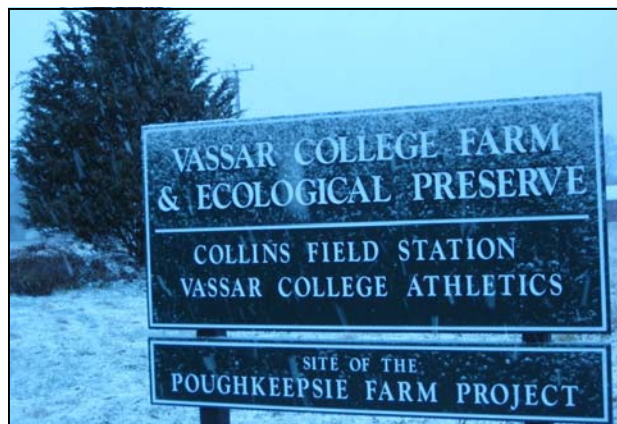
Winter finally arrived! The new sign installed by Vassar College experiences its first snowstorm.