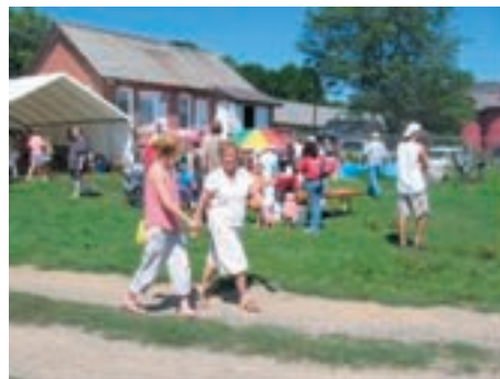
Distribution of PFP Produce, 2006